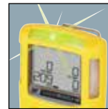
Easy to See