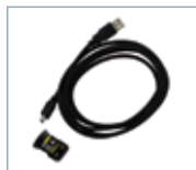
IR connectivity kit