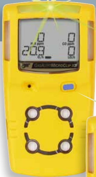
GasAlert MicroClip X3

Guaranteed to run for an entire shift — even in harsh weather.