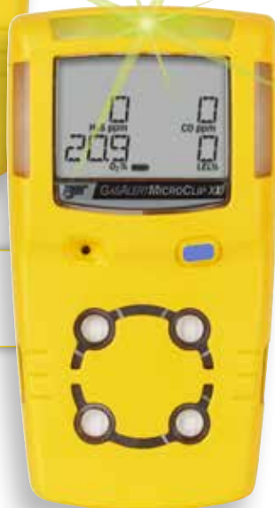
GasAlert MicroClip XL

NEW! GasAlertMicroClip Series now features IP68 for maximum water and dust protection.