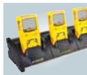
Five unit cradle charger

For a complete list of kits and accessories, please contact BW Technologies by Honeywell.